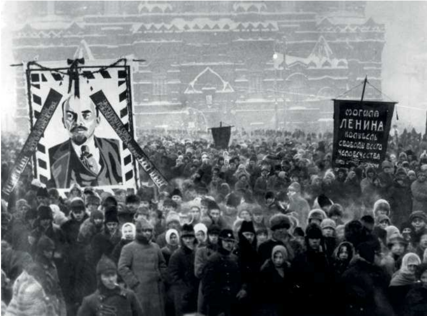
Figure 1.2: The 1924 funeral procession of Vladimir Lenin, attended by four million people. By 1924, Russia had undergone huge changes and was a communist state.