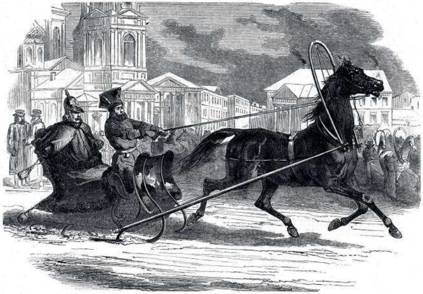
Figure 1.1: This 1853 illustration shows Nicholas I, father of Alexander II, being driven through St Petersburg; at this time, the Tsar was all-powerful.

This book is designed to prepare students for Imperial Russia, Revolution and the Establishment of the Soviet Union (1855–1924) . This is Topic 12 in HL Option 4, History of Europe for Paper 3 of the IB History Diploma examination. This option examines the conflicting parts played by modernisation and conservatism in Tsarist Russia and explores reasons for the eventual collapse of the Tsarist autocracy in 1917. It explores continuity and change through the revolutions of 1917, the Civil War and the rule of Lenin. There is a particular focus throughout on the interaction of the social, economic and political factors responsible for change.