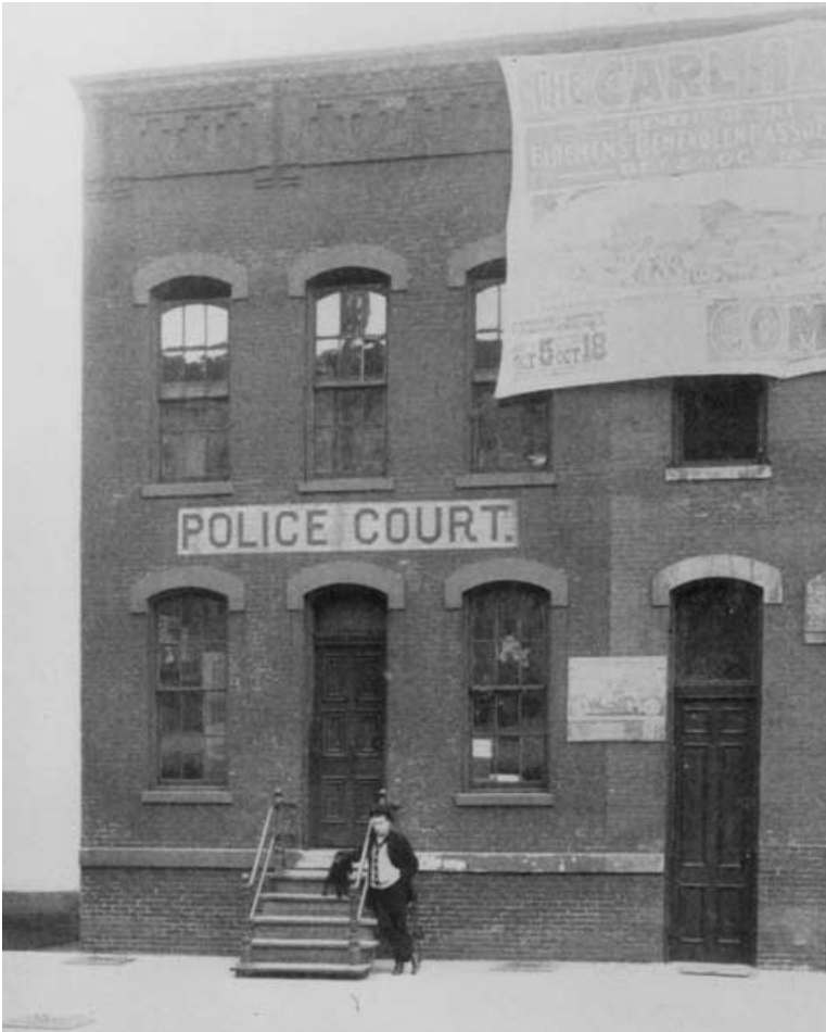
The old West Chicago Avenue Police Court, photographed c. 1908, after it had been renamed as one of the neighborhood “criminal branches” of the new centralized Municipal Court system.

The next chapter narrates the political struggle over local judicial administration that led to the creation of the Municipal Court of Chicago and the dozens of city courts made in its image. This chapter recovers, so far as the historical record will allow, the American way of doing justice that the municipal court movement and its rhetoric of modernity left behind. Because the justices’ dockets have perished, the historian’s challenge is to read through reformers’ condemnations of the “antiquated” and “evil” justice shops to reveal the logic and practice